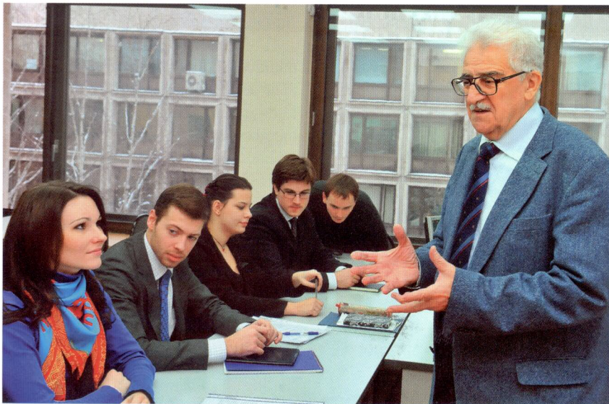
Nodari Simonia, Academician of the Russian Academy of Sciences, holds a workshop with IIEP students

In order to further perfect the training of personnel to meet the real needs of Russian energy diplomacy and the domestic fuel and energy complex, the IIEP devotes